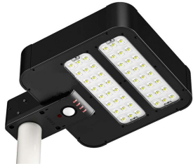
13w / 18w