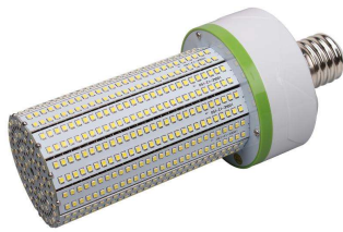
40w – 150w