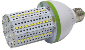
15w – 30w